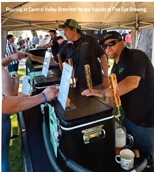
Pouring at Central Valley Brewfest for our friends at Five Eye Brewing.

Since 1989, Cal Freight has provided customized transportation solutions for all industries. Our involvement in brokerage, port drayage, food grade tankers, and warehousing keeps us in the forefront of our industry.