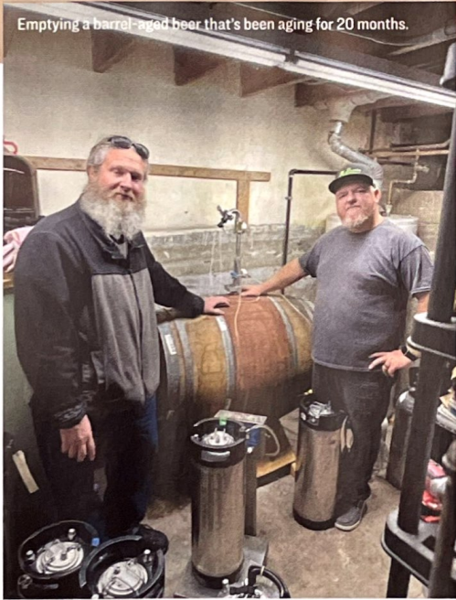
Emptying a barrel-aged beer that's been aging for 20 months.